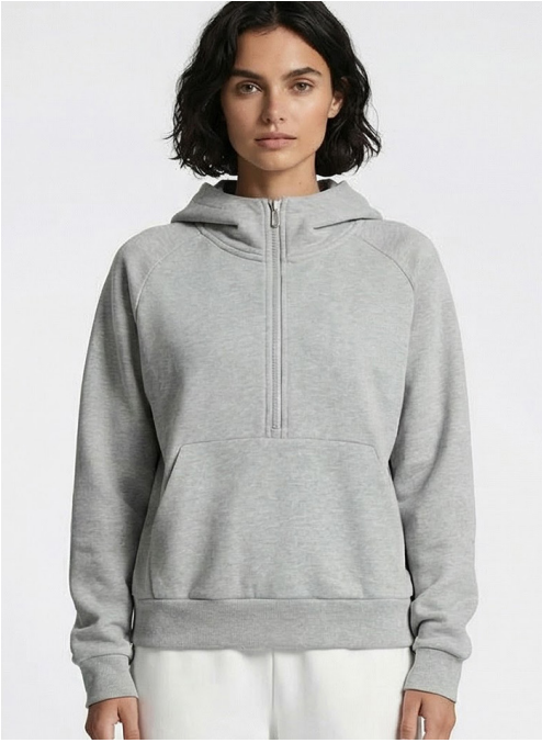
8467 WOMENS HALF-ZIP HOODIE HALF-ZIP FULLY LINED HOOD - POUCH POCKET BLACK, GREY, WHITE SIZES: XS-2XL MSRP: $ 49.96