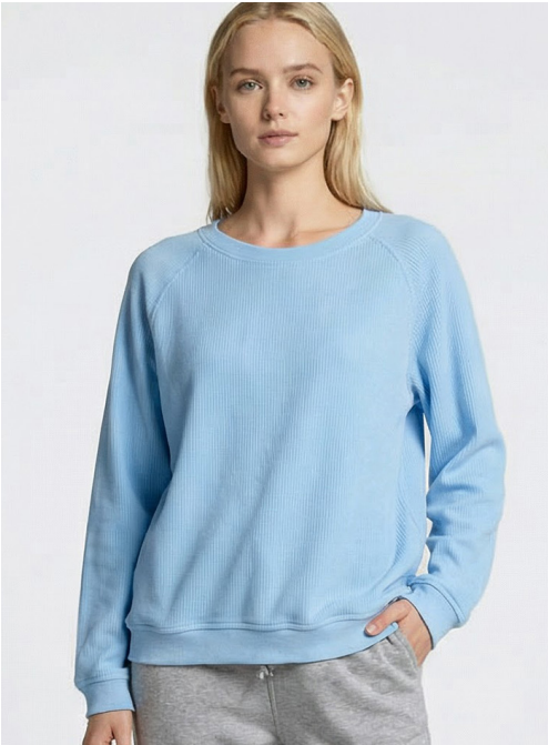
5448 MODERN CORD CREW RELAXED FIT - EASY TO DECORATE BLACK, CREAM, BLUE, WHITE SIZES: XS-2XL MSRP: $ 39.86