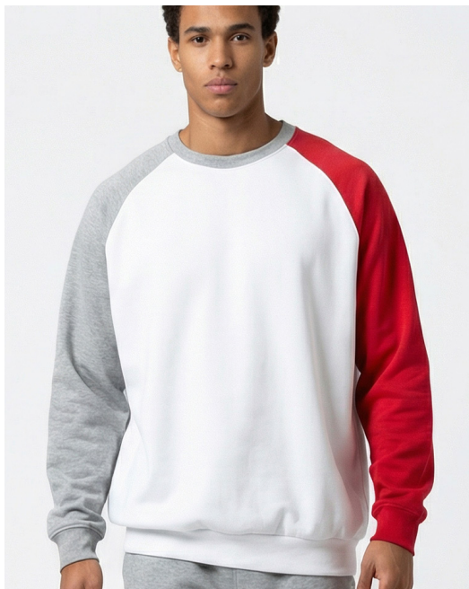
8570 COLORBLOCK CREWNECK PREMIUM FLEECE - 9.0 OZ. 60% COTTON / 40% POLY WHITE FRONT / RT SLEEVE = GREY / LFT SLEEVE = COLOR BLACK, RED, ROYAL SIZES: XS-3XL MSRP: $ 44.50