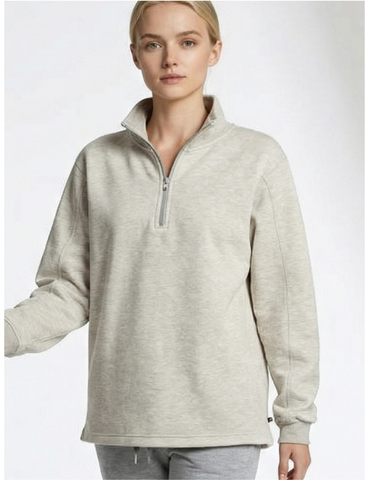
616 WOMENS CLASSIC 1/4 ZIP PREMIUM PENNANT FLEECE - 9.5 OZ. 60% COTTON / 40% POLY BLACK, GREY, CHARCOAL, NAVY, VINTAGE HEATHER SIZES: XS-2XL MSRP: $ 37.70