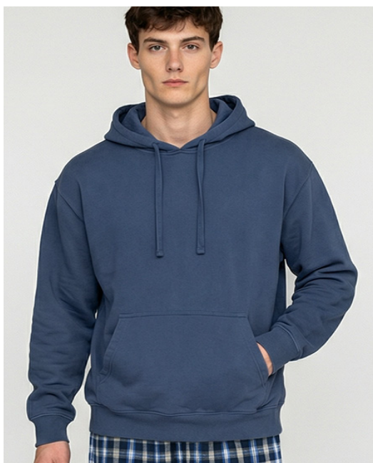
8651 MID-WEIGHT HOODIE 9.0 OZ. MIDWEIGHT FLEECE 80% COTTON / 20% POLY BLACK, NAVY, BURGUNDY, DK GREEN, RED, BLUE, NATURAL SIZES: XS-3XL MSRP: $ 29.90