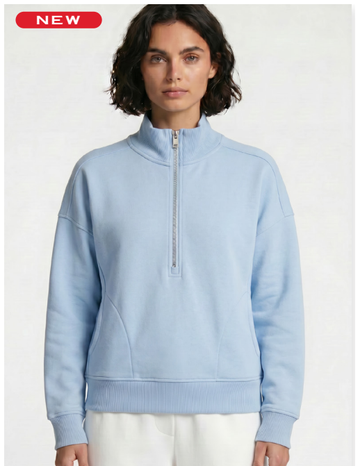
5488 WOMENS HALF-ZIP MOCK SIDE POCKETS - SILVER ZIPPER BLACK, GREY, CREAM, BLUE SIZES: XS-2XL MSRP: $ 39.88