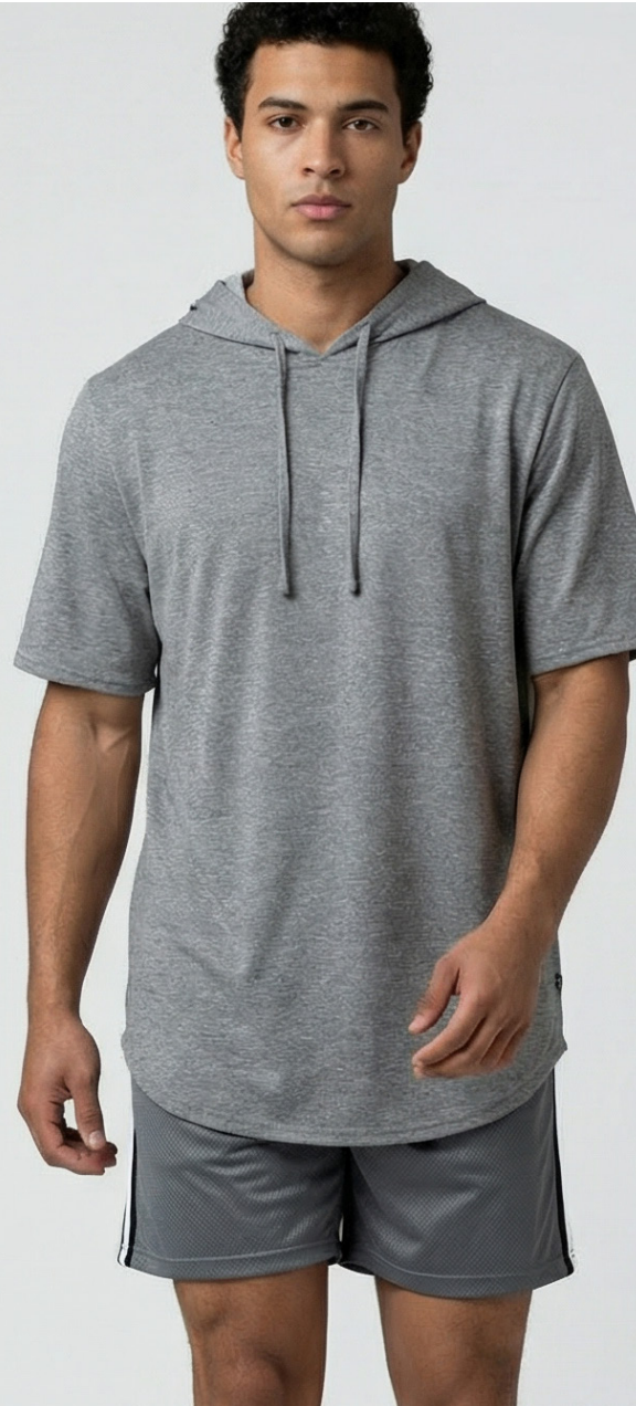
183 SHORT SLEEVE WARMUP HOODIE MID-WEIGHT PERFORMANCE INTERLOCK BRUSHED INSIDE BLACK, CARBON HEATHER, NAVY, WHITE SIZES: XS-3XL MSRP: $ 35.60 [ADULT, YOUTH ]