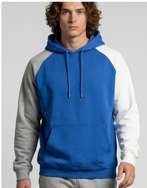
8571 COLORBLOCK HOODIE PREMIUM FLEECE - 9.0 OZ. 60% COTTON / 40% POLY FRONT, HOOD = COLOR /RT SLV =GREY / LFT SLEEVE=WHITE NAVY, RED, ROYAL SIZES: XS-3XL MSRP: $ 48.50