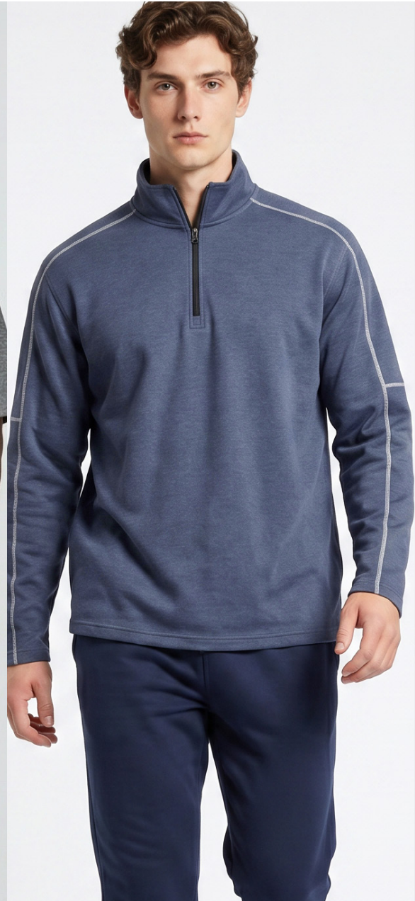
1149 HEAVYWEIGHT JERSEY OTR ZIP HEAVYWEIGHT PERFORMANCE JERSEY SOFT FEEL - ACCENT STITCHING BLACK, NAVY, CHARCOAL, GREY SIZES: XS-3XL MSRP: $ 41.90 [ADULT, YOUTH ]