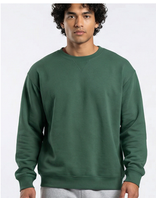
8650 MID-WEIGHT CREWNECK 9.0 OZ. MIDWEIGHT FLEECE 80% COTTON / 20% POLY BLACK, NAVY, BURGUNDY, DK GREEN, RED, BLUE, NATURAL SIZES: XS-3XL MSRP: $ 29.90